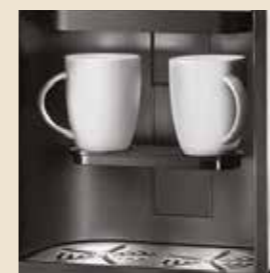
Separate delivery points: Coffee, chocolate, and mixed drinks on the left, and water on the right. This prevents any cross contamination into the water.