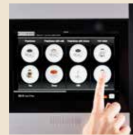
The 10" touch screen - 1280 x 800 - offers a visual guide, making choices easy. The design and layout of the screen can also be fully customized to suit any environment.